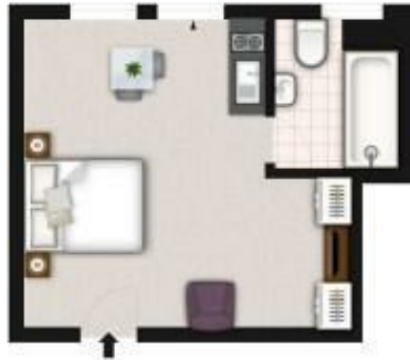
Illustration For Identification Purposes Only. Not to Scale * As Defined by RICS - Code of Measuring Practice

Approx. Gross Internal Area * 254 Ft 2 - 23.60 M 2